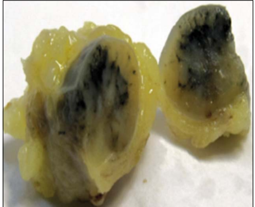
Human lymph node loaded with black Tattoo Ink

And the process can be very expensive, painful, in some cases ineffective, and is not covered by insurance, he added.