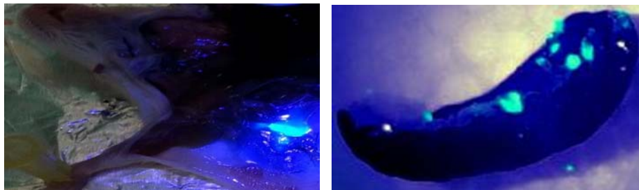
Tattooing effect on experimental mouse: Twenty-four hours after tattooing using blue fluorescent ink on the left shoulder of a mouse, its axillary lymph node, left, and spleen, right, were found loaded with blue fluorescent ink as seen under an ultraviolet light.

RESEARCHER TAKES MORE THAN SKIN-DEEP APPROACH TO STUDYING THE BODY-ART RAGE