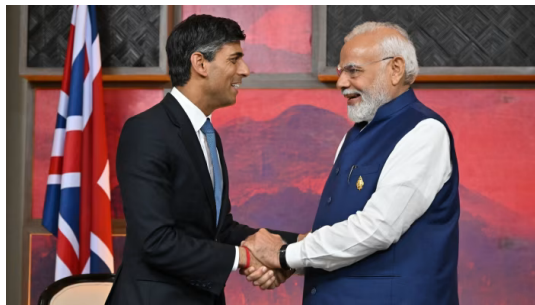
Never easy: trade negotiations between the Prime Ministers of India and the United Kingdom

The Secretariat is funded from the regular budget of the WTO, to which all members contribute. Its annual funding demand amounts to approximately $135 million, to which the United States is the top contributor. The WTO budget also supports the International Trade Center, a capacity-building organization supported by the WTO and the United Nations Conference on Trade and Development (UNCTAD).