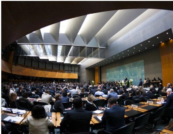
A meeting of WTO member states at the organization's headquarters in Geneva, Switzerland.

Agreement (TiSA), the Government Procurement Agreement (GPA), and the Environmental Goods Agreement (EGA). Many countries have also turned to bilateral free trade agreements (FTAs) or larger regional ones. 14