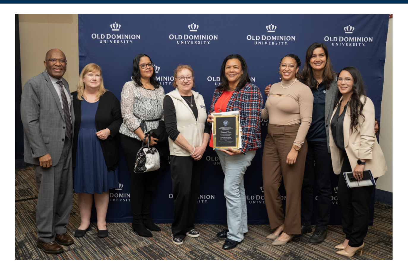
Photo Gallery: Annual Recognition Luncheon held April 5, 2024 at Webb Center