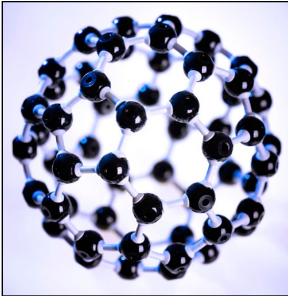
An example of a nanoparticle is a buckyball or fullerene.